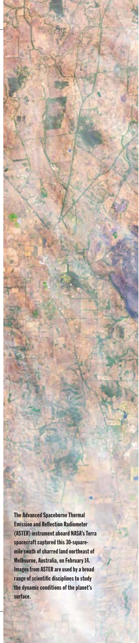
The Advanced Spaceborne Thermal Emission and Reflection Radiometer (ASTER) instrument aboard NASA's Terra spacecraft captured this 30-square-mile swath of charred land northeast of Melbourne, Australia, on February 14. Images from ASTER are used by a broad range of scientific disciplines to study the dynamic conditions of the planet's surface.