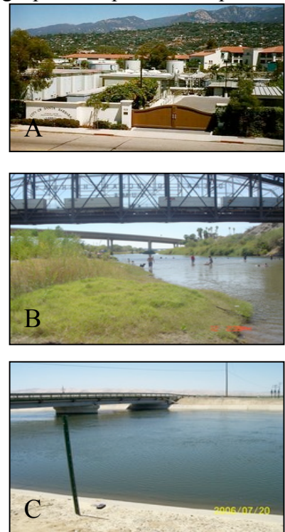
Fig. 1. Examples of fresh water production: Santa Barbara Charles Meyer desalination facility (A), the Colorado River at the Yuma Arizona 4 th St. Bridge (B), and the California aqueduct water into Southern California (C).

The CCC lists 12 existing facilities along the California coast (tables 1 and 2) with another 19 proposed (table 3). The sizes of the facilities vary according to design. Proposed or existing California desalination plants range from 80 square feet to 7.5 acres. Heights are from 15–20 feet for typical reverse osmosis equipment and 30–45 feet for typical distillation equipment.